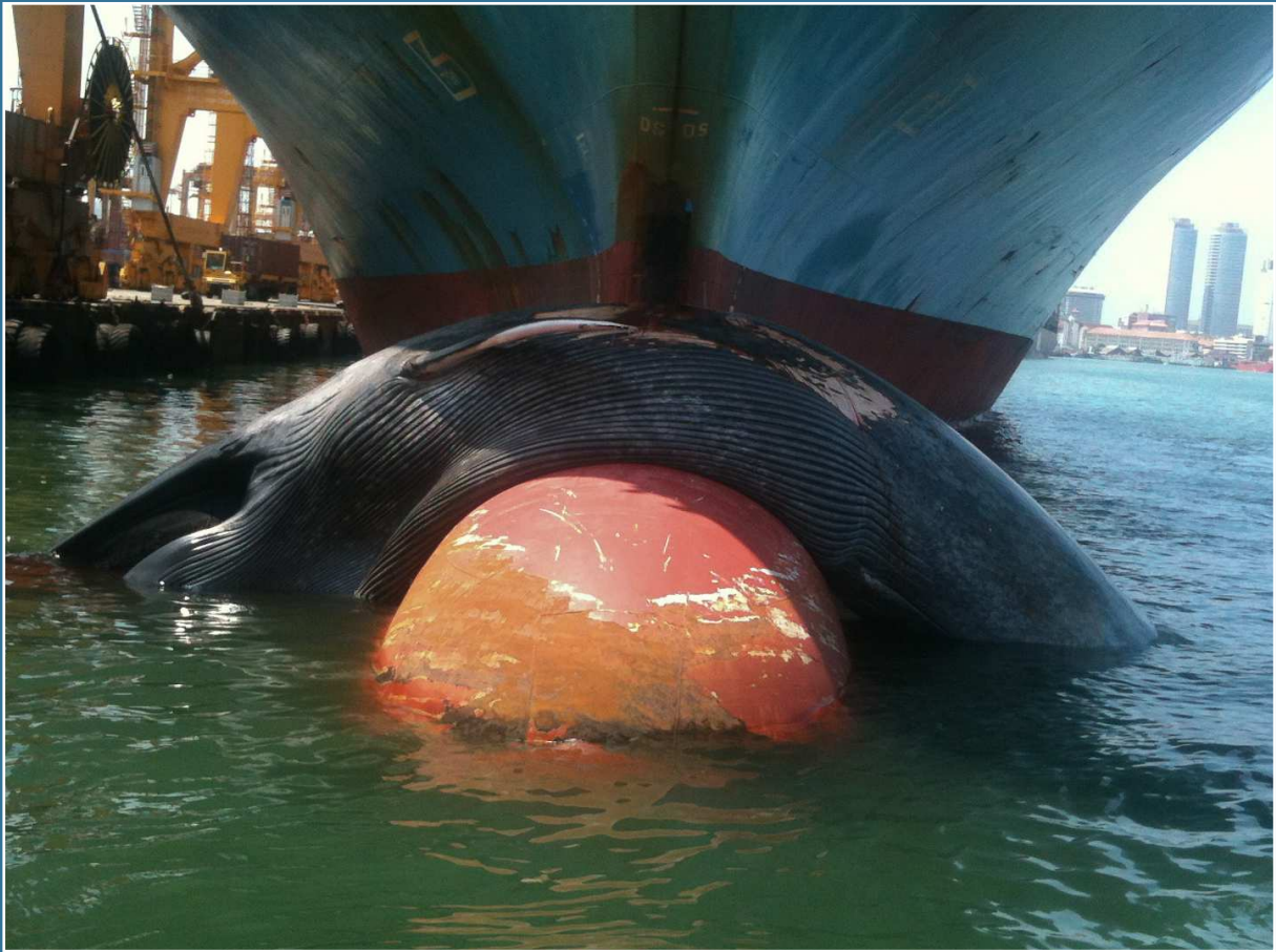
Figure 2: Blue whale on the bow of container ship Quartz at Colombo Harbour on 20 March 2012.