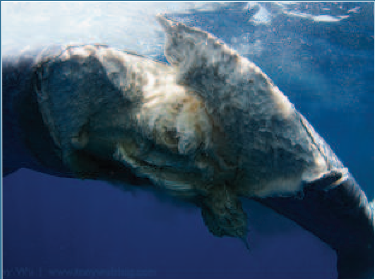
Figure 3: Blue whale carcass found floating at sea south of Mirissa on 2 April 2012. Large gash that almost severed tail stalk indicates that whale death was caused by ship-strike (Photo credit: Tony Wu).